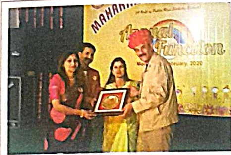
BHANWAR JITENDRA SINGH Former Central Minister